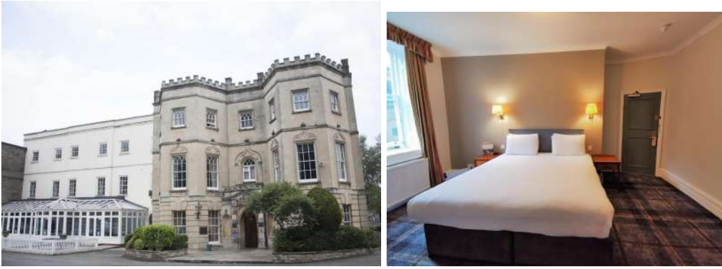
Arnos Manor Hotel - From £88 per night